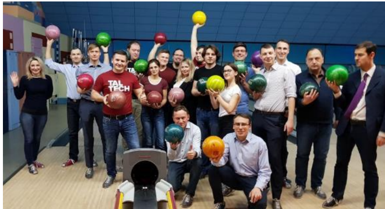
IEEE IES Young Professionals & Student (YPS) cooperation inside Society and outside of the Society: IES YPS party at bowling.